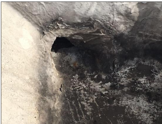
18. As Above.