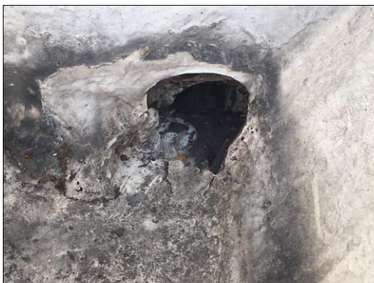
16. Andrewes House Barrel Roof Areas Liquid has de-bonded from the concrete upstand with cracking also evident causing water ingress.