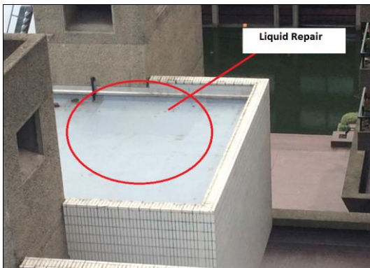
14. Barbican Centre roof Liquid repair indicating previous water ingress issues.