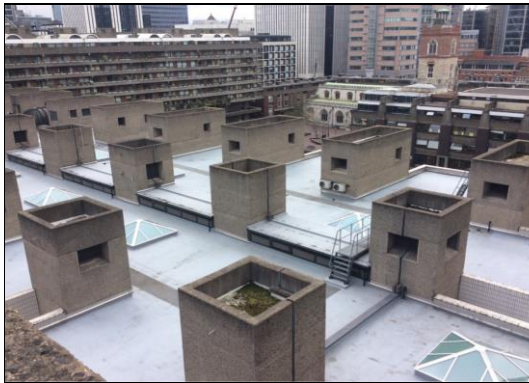
13. Barbican Centre roof Overview of the Barbican Centre roof.