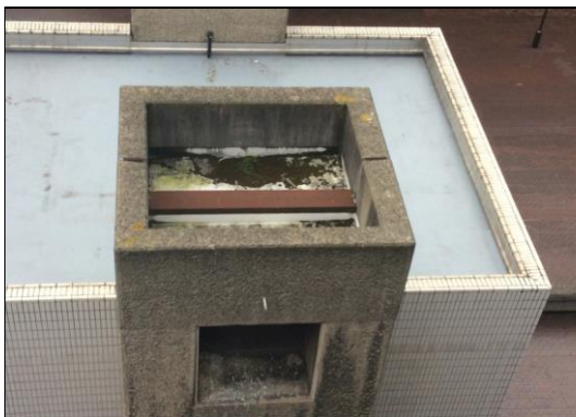
15. Barbican Centre roof Vegetation growth on existing asphalt stairwell roof.