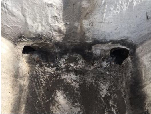
17. As Above.